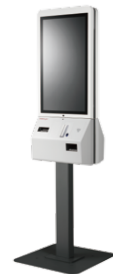
Dual Sided Operation