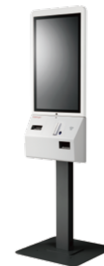
Single Sided Operation